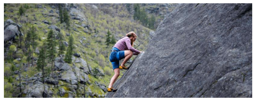
I like rock climbing because it is dangerous

EXERCISE 07: Go through all the adjectives above and look up any words you don't know in a dictionary.