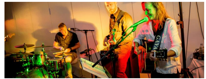
Our band played live for the first time last week

Our band played live for the first time last week. We were all really nervous, but it went pretty well. I think we were all surprised by how much the crowd liked us.