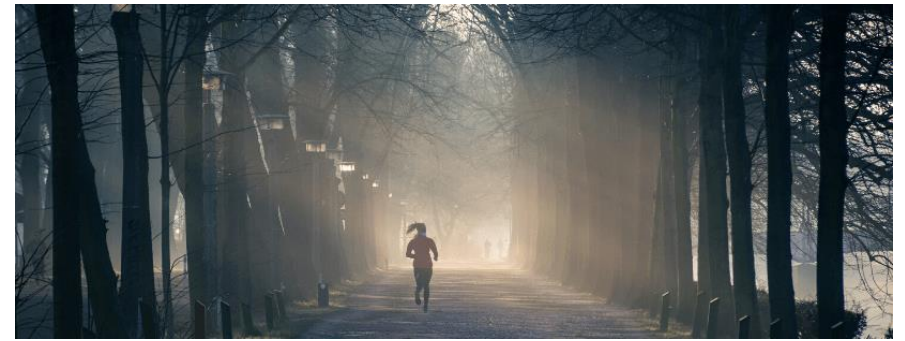
I ran up the hill for the first time

Two weeks ago I was doing my morning run. I got to this hill that I usually walk up because I feel too tired at that point to continue running. But I really surprised myself by running right to the top. I felt really proud of myself.