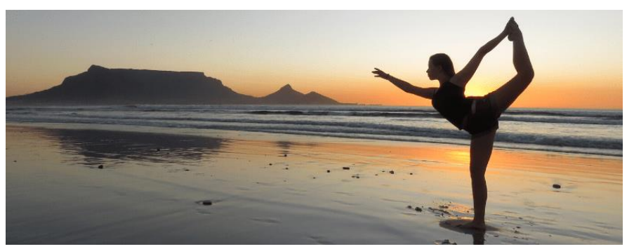
In my opinion, yoga is very relaxing.

In my opinion, doing yoga is a very good thing to do. It can really help you relax and we all need to do that in modern society.